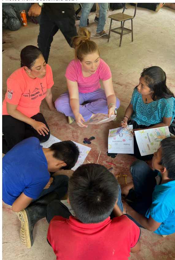
Photos from Guatemala 2024

March 22-28 $1,500 estimated $200 deposit required 9th-12th grade (30 spots available)