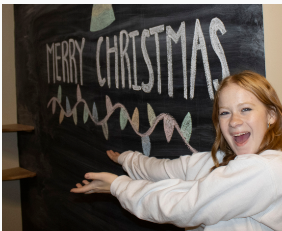
Photo from Christmas Extravaganza 2023

Christmas extravaganza is exactly what it sounds like. This is our annual, elaborate and spectacular Christmas party with our students! This night will be filled with fun, food, games, gifts, and so much more!