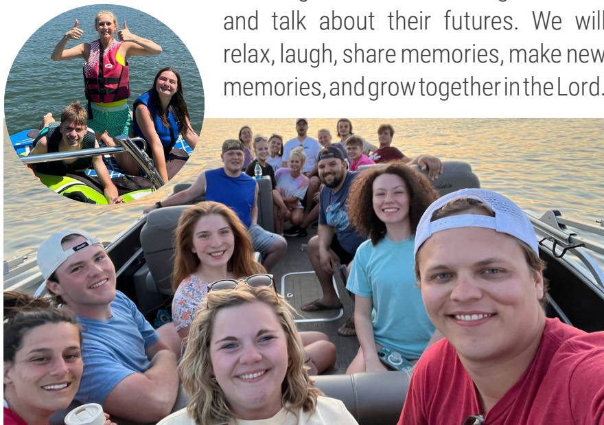
Photos from Senior Trip 2024

This trip is specifically designed to spend some quality time with our seniors after they graduate and before they head off to college. We take our seniors on a trip away from home where we hang out, eat a lot of good food, and talk about their futures. We will relax, laugh, share memories, make new memories, and grow together in the Lord.